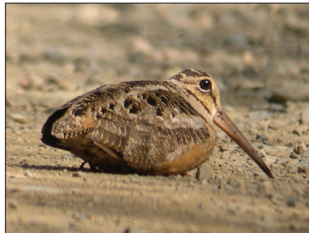
American Woodcock by Bob Duchesne

On a typical birding expedition, you might only spend a few seconds observing an individual bird. This program by Maine Audubon's Staff Naturalist, Doug Hitchcox, will help you understand what a bird may be doing during that short window into its life. Doug will cover topics such as bird song (including female vocalizations), roosting and where birds choose to sleep, the marvelous feats of migration, and many other surprising behaviors by our feathered friends.